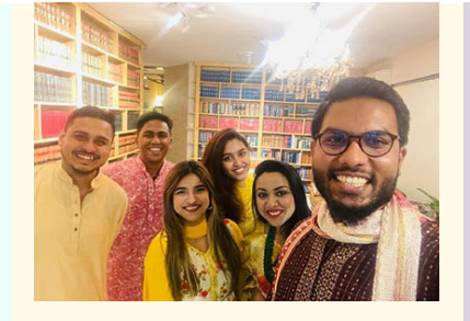
Legal Counsel celebrated Pohela Falgun on 13th February 2023. It is the first day of spring of the Bengali month 'Falgun'. Celebrating this joyous occasion conveyed the firm's appreciation for the cultural diversity in Bangladesh.

Legal Counsel made donations to support an initiative to clean up plastic waste menace in St Martin's Island and to support the project of Ek Takay Ahar. These donations were made to Bidyanondo which is an educational voluntary organization in Bangladesh.