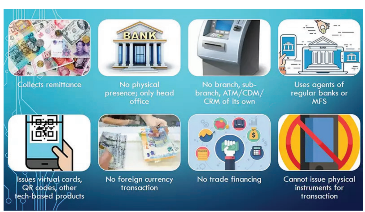
Key features of Digital Banks

Digital banks lead in tech innovation with mobile check deposits, budgeting tools, and real-time alerts. Traditional banks, while slower to adapt, have improved their online and mobile services in response to digital competition.