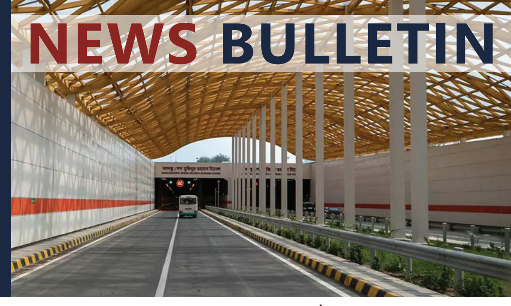
ISSUE 18 | DATE: DECEMBER 31, 2023