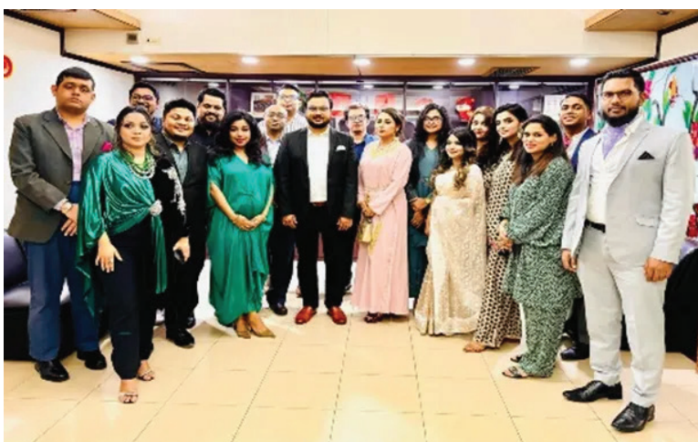
Legal Counsel's Annual Dinner 2023