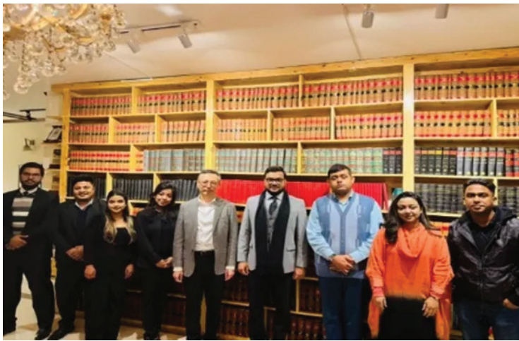
The Deputy Chief of Mission, Embassy of Japan, visited Legal Counsel on 25 January 2024.