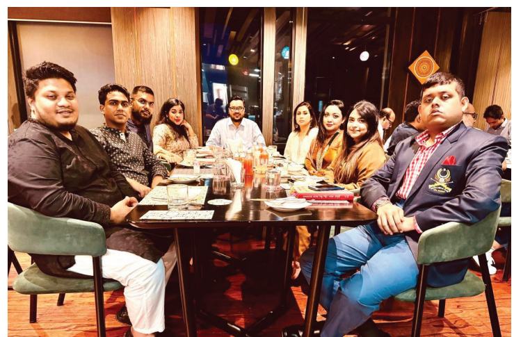
Legal Counsel's Iftar 2024