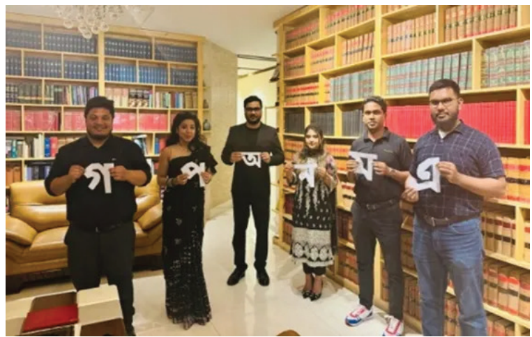
International Mother Language Day 2024 at Legal Counsel.